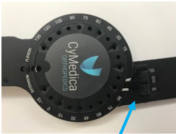
Knee brace with slide lock engaged

With your leg fully extended, move the slide lock on both brace hinges towards your thigh. Carefully, retract the slide lock to ensure it is completely removed from the mating slot on the hinge.