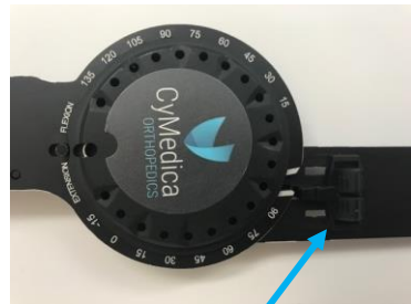
Knee brace with slide lock disengaged