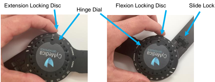
Using the Locking Disc to set Extension Limit at 30°