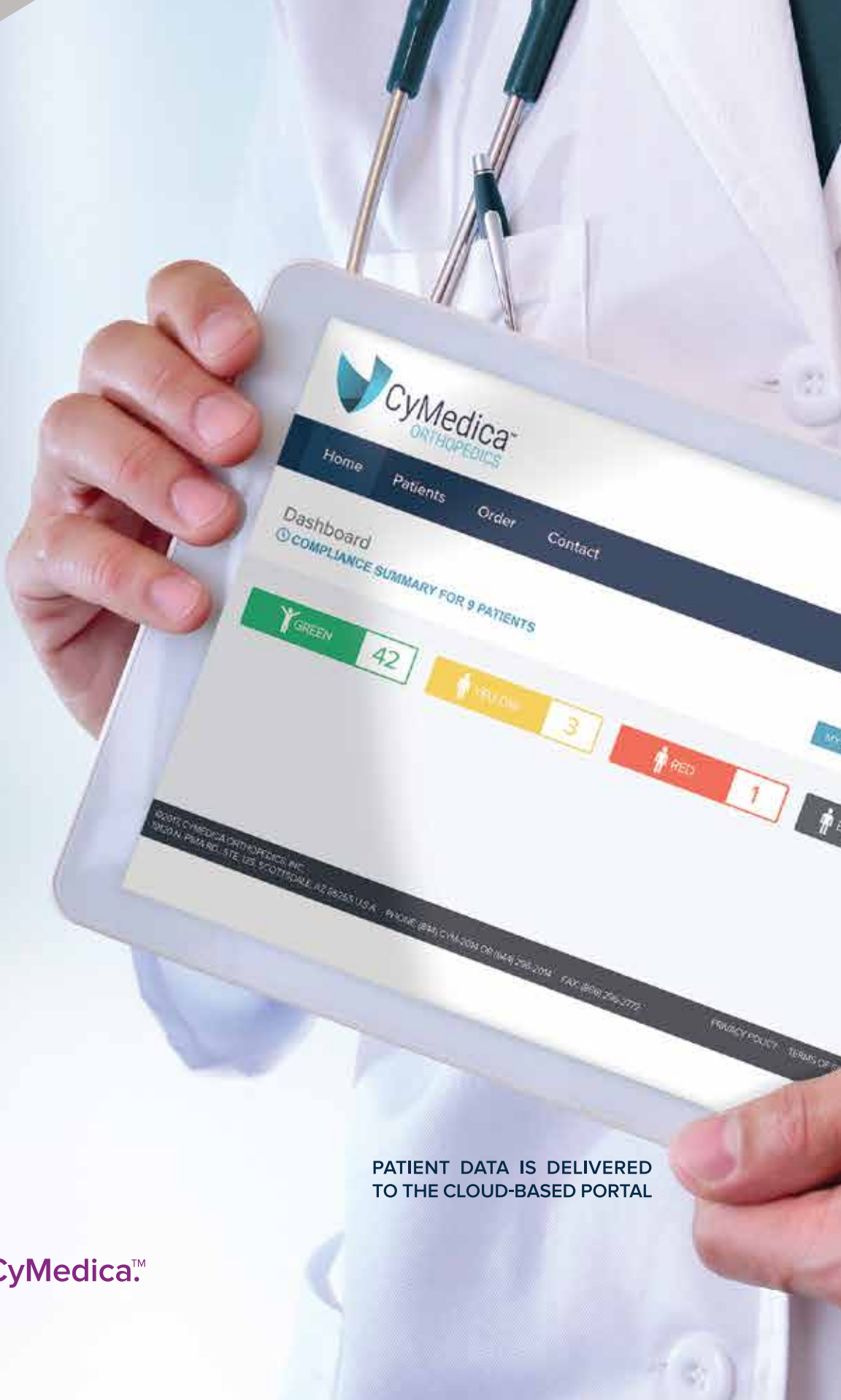
PATIENT DATA IS DELIVERED TO THE CLOUD-BASED PORTAL

CyMedica™ is focused on delivering advanced muscle activation solutions for tele-rehabilitation because more engaged patients means faster recovery times, lower chances of readmission, and more predictable outcomes.