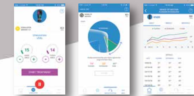
STIMULATION INTENSITY RANGE OF MOTION PROGRESS TRACKER